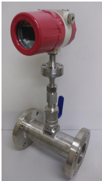
tekMass TMS – P In-Line Sensor

All tekMass flow sensors are calibrated against a gas flow primary standard and are traceable to USA National Institute of Standards and Technology (NIST) and other international standards. Both circular and equivalent area quadrilateral duct cross sections are available. The sensor insertion rod is optionally accurately graduated and marked for the particular internal diameter in which it will be used.