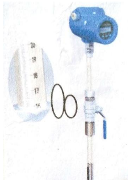
tekMass TMS – S or B Insertion Sensor